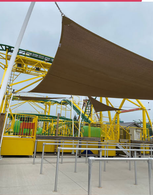
FLX Shade™ system above a queuing area.